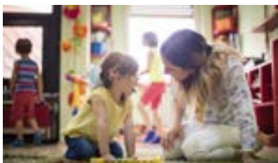
Sunday Worship Childcare & Nursery