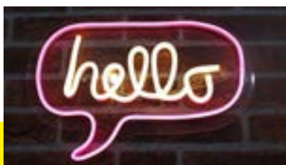
Greeters & Ushers